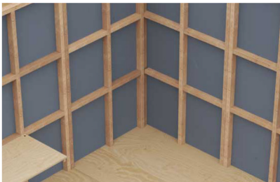
Timber wall framing 70x45 studs and noggs