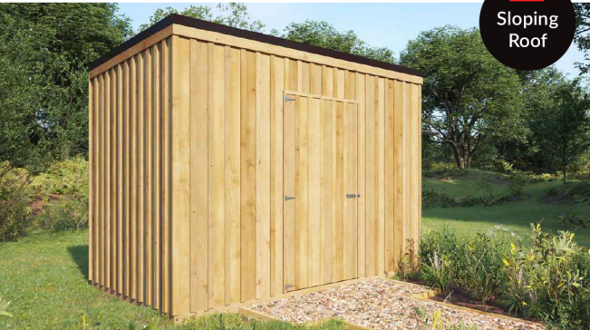
Shed Height Front: 2.2m Rear 2.1m