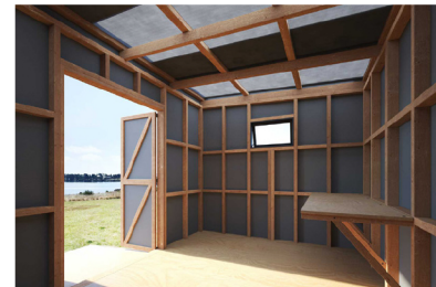
Timber shelving and double doors available