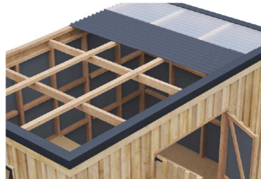
Colorsteel® 0.4 roofing & flashings